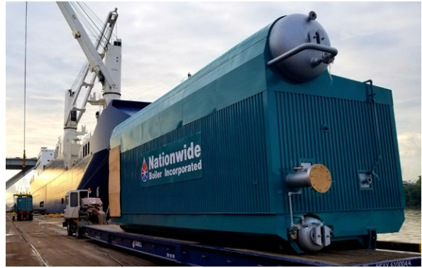
Figure 3. Installing these two high-pressure, skid-mounted deaerators rental units required cranes for offloading and placing at the jobsite.