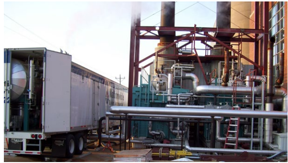
Figure 5. Five 75,000 lb/hr trailer-mounted superheated steam boilers with Urea-based CataStak selective catalytic reduction systems are installed in parallel.