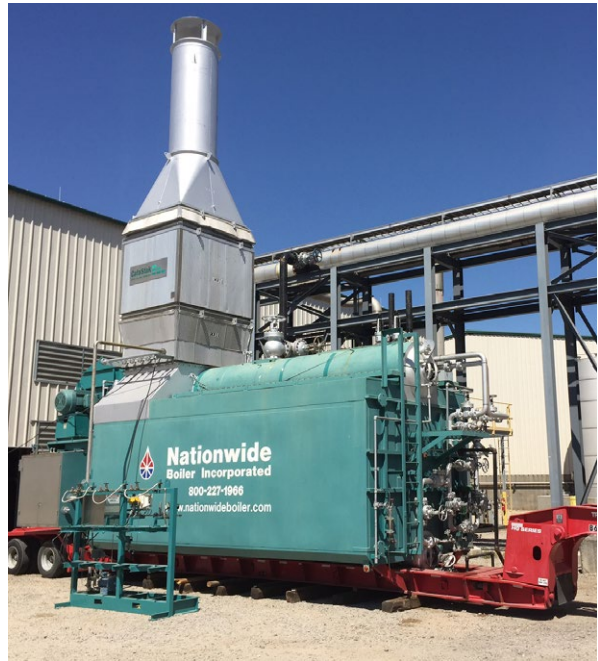
Figure 7. This package water tube rental boiler includes a temporary enclosure for temperature conditions at or below freezing.