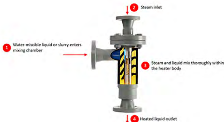
Figure 2. Advanced-Design type DSI heater allows for rapid mixing and instantaneous heat transfer.

An Advanced-Design type DSI Heater disperses the steam in many fine streams through precisely arranged orifices, promoting rapid mixing and instantaneous heat transfer. As the steam enters the internal injection tube it acts against a spring-loaded piston to expose some or all of the orifice pattern. As the steam input varies due to load changes, the piston adjusts the number of exposed orifices, providing rapid response to process changes.